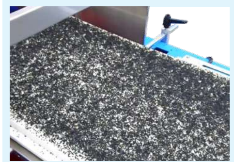
Vibration sowing of medium-sized seeds.