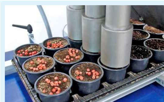
Corn volumetric sowing.