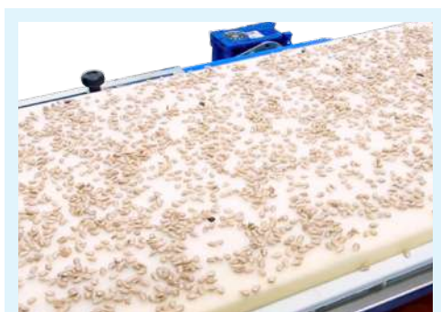
Vibration sowing of big seeds.