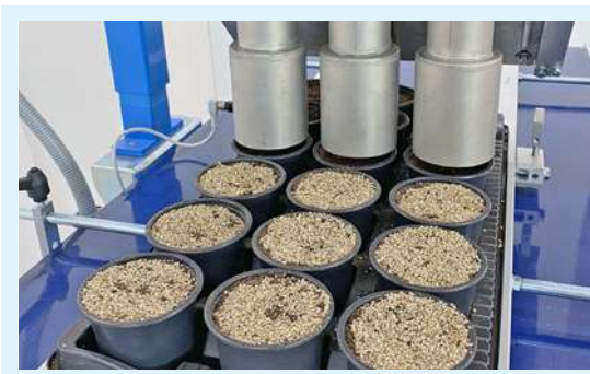
Localized covering with vermiculite.