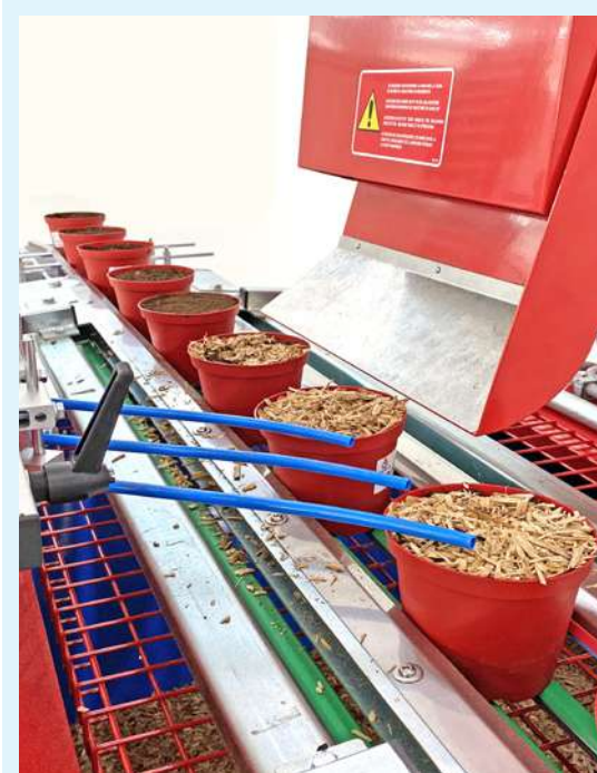
Position and height of leveler tubes are manually adjustable: the excess material removed is automatically put back into circulation.