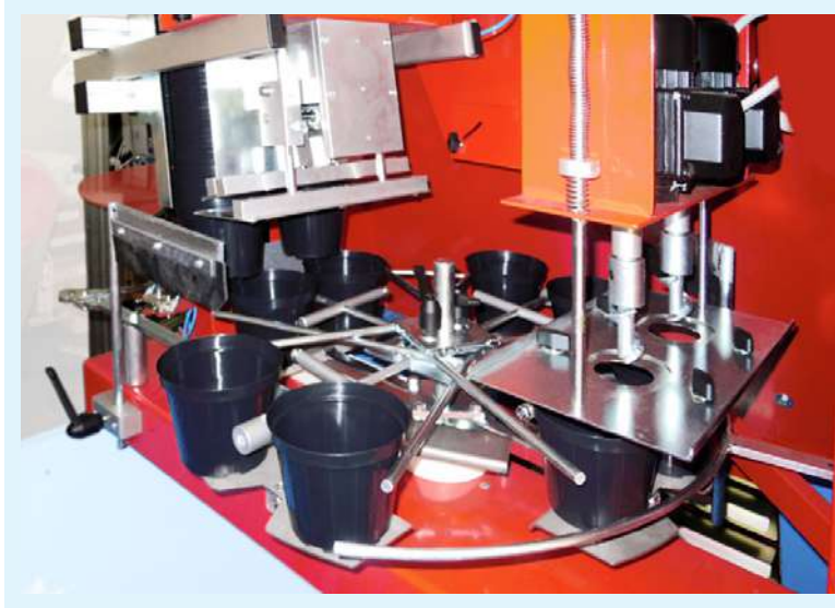
Double head version for pot from diam. 8 to 14 cm : up to 3500 pots/hour .