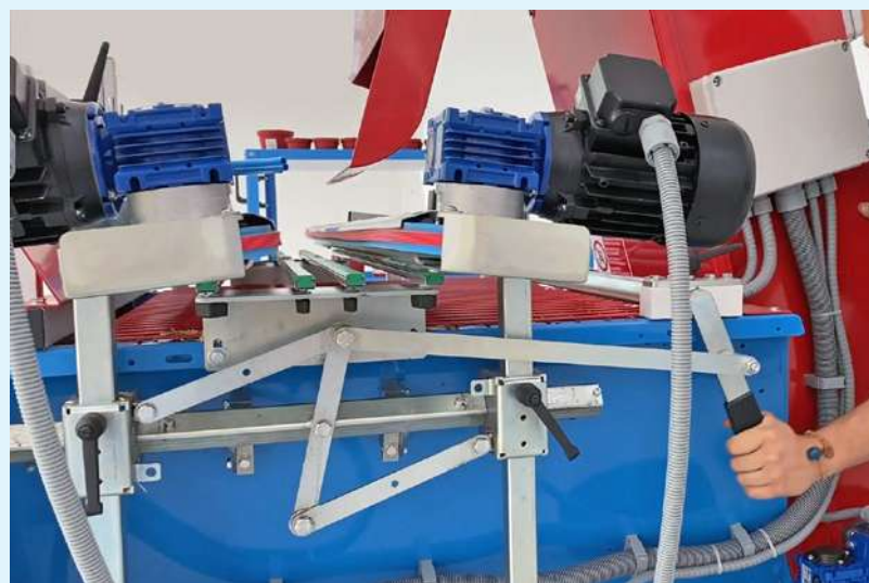
Pot passage width quickly adjustable with a single crank.