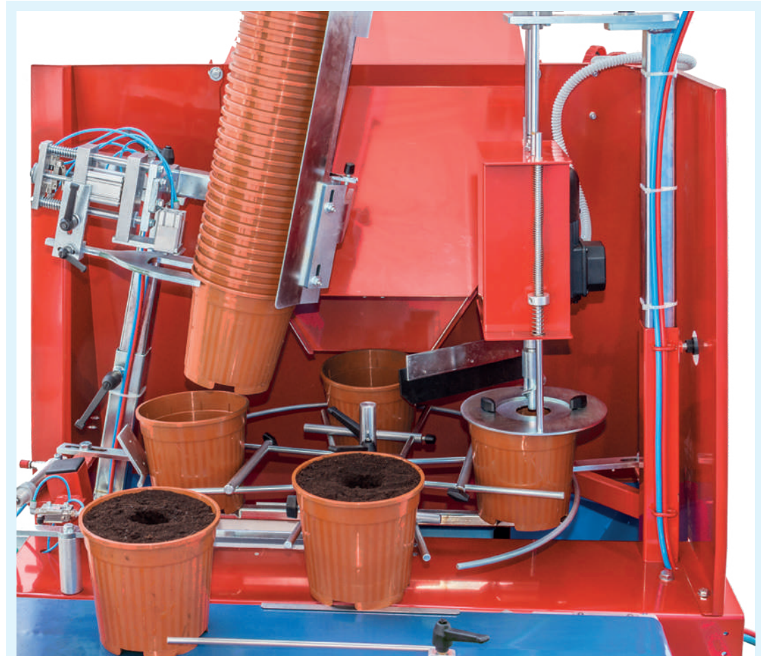
Single head version: up to 2400 pots/hour .