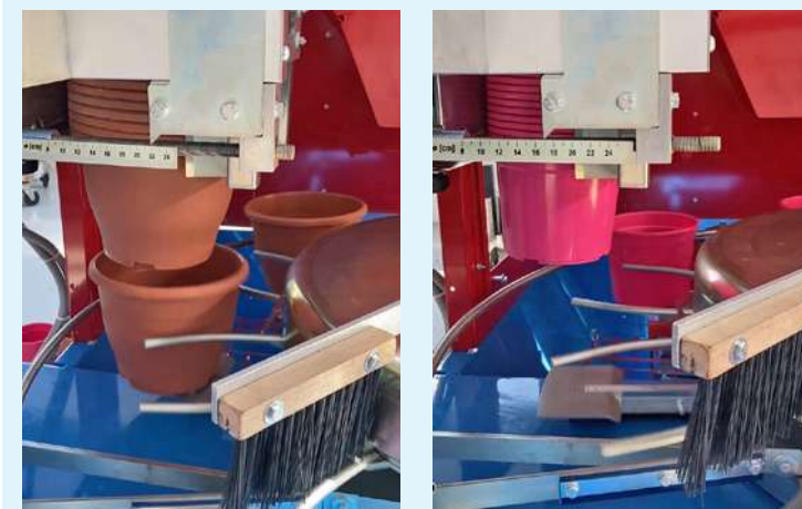
IA3500 single-headed potting machine: it is able to work with pots from 8 to 27 cm, of different shapes and materials.