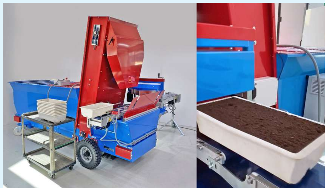
IM2800 equipped for open-trays filling.