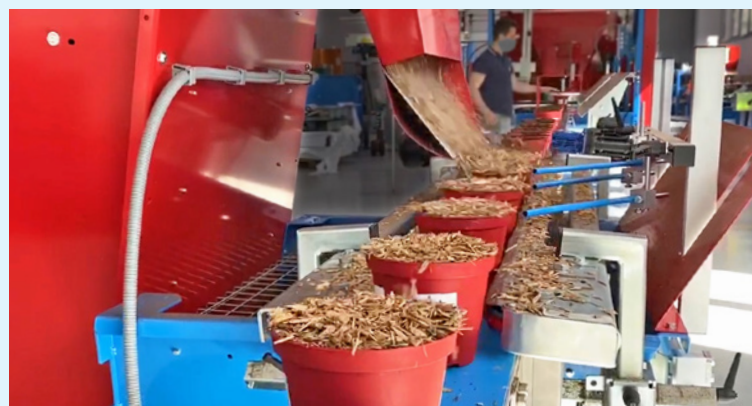
TP2800 in line with IA3500 potting machine configured with central output belt; covering of pots with miscanthus.