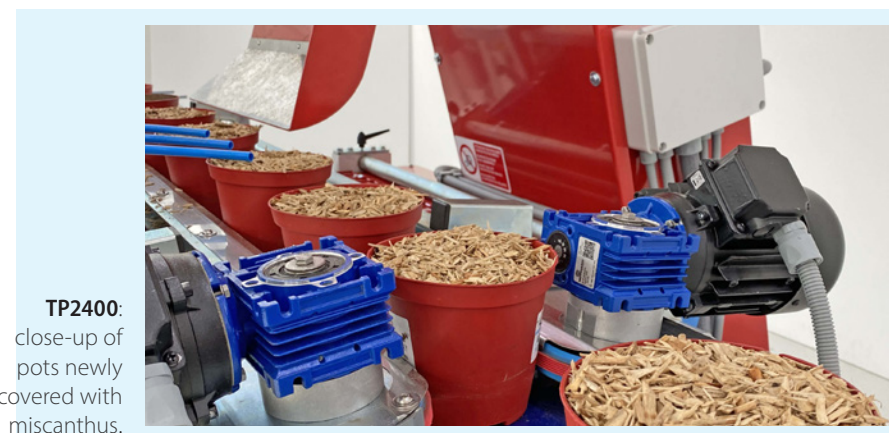
TP2400: close-up of pots newly covered with miscanthus.