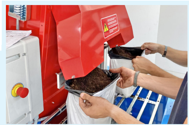
IM1800 assembled with double discharge outlet for the manual filling of plant bags (fitobags).