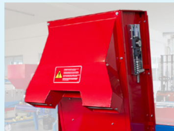
Double soil discharge outlet.

IM2800 equipped with chute and ground base with vibrating motor : particularly suitable for the filling of large pots .