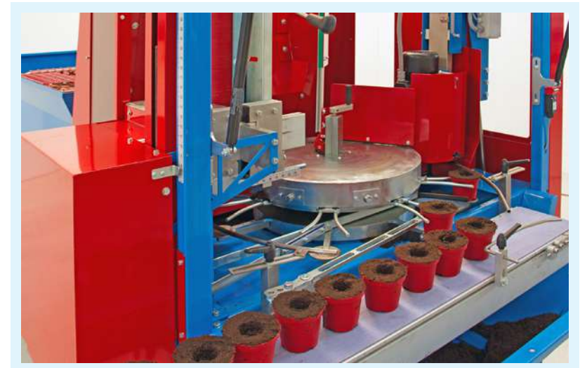
IA3500 with single head: pots in output from the carousel.